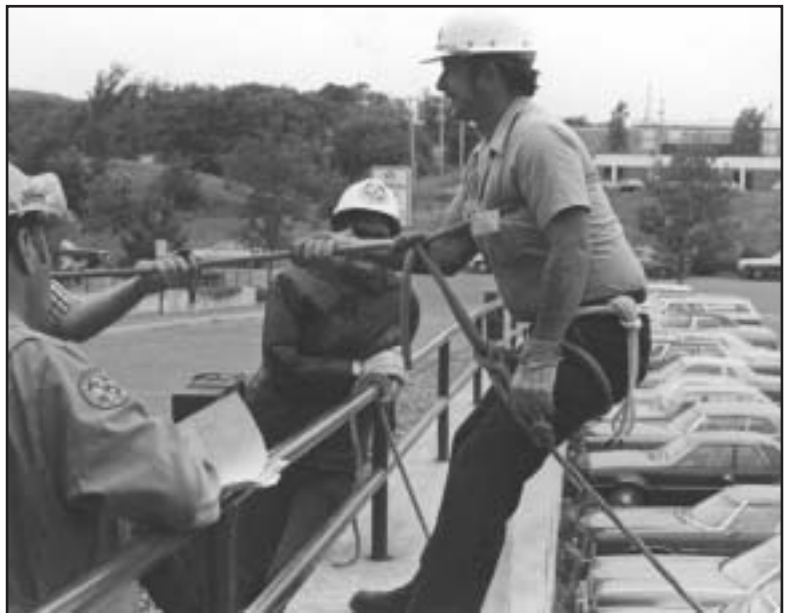
Have techniques changed?? Photo taken at the 31st annual conference and competition.

All in all, both the Figure of 8 family of knots and the Bowline are excellent knots. They both have good features as to being easy to tie and untie. They both exceed the recommended safety factor ratio of 15:1 set forth by the NFPA 1983 standard. However, the Bowline fits into the IRECA concept of rescue by making things easier, simpler, and more efficient, using less equipment.