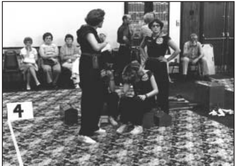
Blast from the Past – Can anyone beat these First Responder competition uniforms?? This picture was taken at the 32nd annual conference and competition. Anyone know the competitors??

Check the IRECA website for updates on details and registration