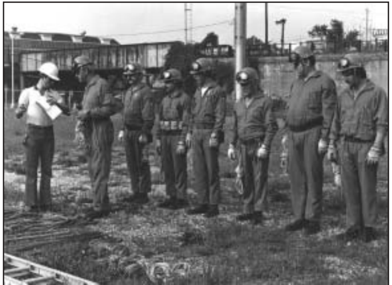
More competition in Rescue: Do you recognize this Technical Rescue team? This photo was taken at the 31st annual conference and competition. This year, the IRECA Technical Rescue committee anticipates approximately 10 teams to compete in the Technical Rescue Competition on Friday, August 23rd.